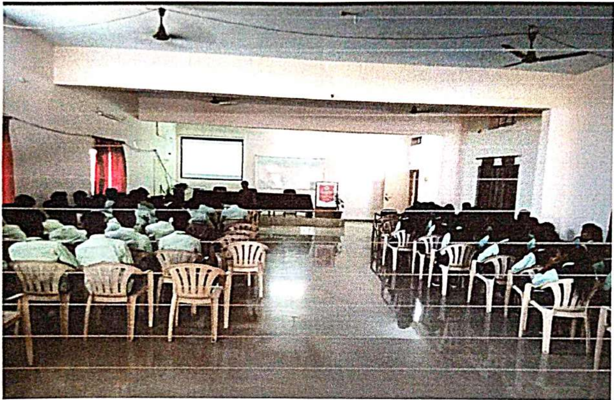
Seminar presentation on Research methods on experimental pharmacology –P. Swathi